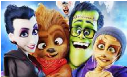
Sat 7 & Sun 8 April Monster Family (PG) 1hr 36mins

Despite the title, the Wishbone family are far from happy. In an attempt to reconnect as a family, Mum and Emma plan a fun night out. However, her plan backfires when an evil witch curses them, and they're all turned into Monsters.