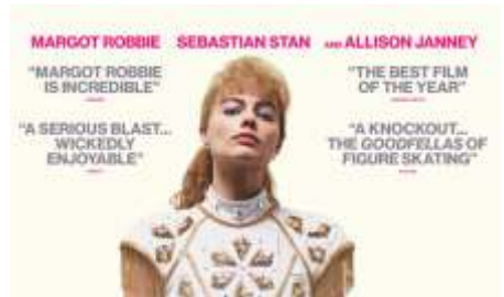
Sat 7 & Sun 8 April I, Tonya (15) 1hrs 59mins

Despite the title, the Wishbone family are far from happy. In an attempt to reconnect as a family, Mum and Emma plan a fun night out. However, her plan backfires when an evil witch curses them, and they're all turned into Monsters.