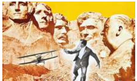
Mon 9 April North by Northwest (PG) 2hrs 16mins